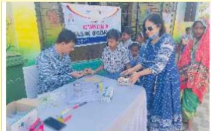
Blood Group Estimation of 45 students from Bhagatwadi village was done by RC of Nasik Godavari.