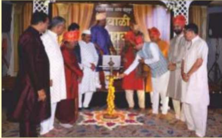
RC Chandrapur celebrated Diwali with a cultural program with Rotarians on 11th Nov. More than 150 members attended and enjoyed this program with their families.