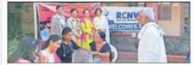
Members of RCNV and Shush Aasra Foundation along with the inmates of Vanprastha Ashram during the camp.