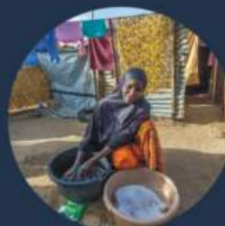
Providing Clean Water