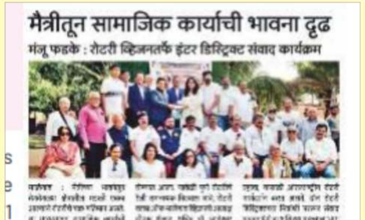
The Inter-District Dialogue-Sneh Mela project was implemented by the Rotary Club of Malegaon Vision for Rotarians from Pune District 3131.