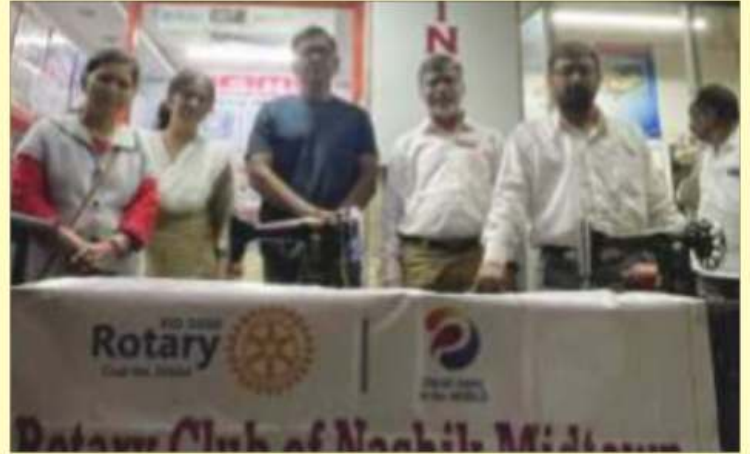
RC of Nashik Midtown gifted two Stitching Machines to needy women from the Tribal area. Area of Focus was community economic development, Women/Girls empowerment