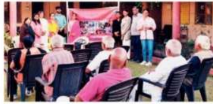
Doctors, RCNV members and senior citizens during the camp.

Rotary Club of Nagpur Vision (RCNV) and Shush Aasra Foundation jointly organised a health camp at Vanprastha Ashram Bahadura recently. Five doctors conducted thorough check-ups for 27 elderly persons, covering BP, sugar and dental assessments. Medications were also pro-