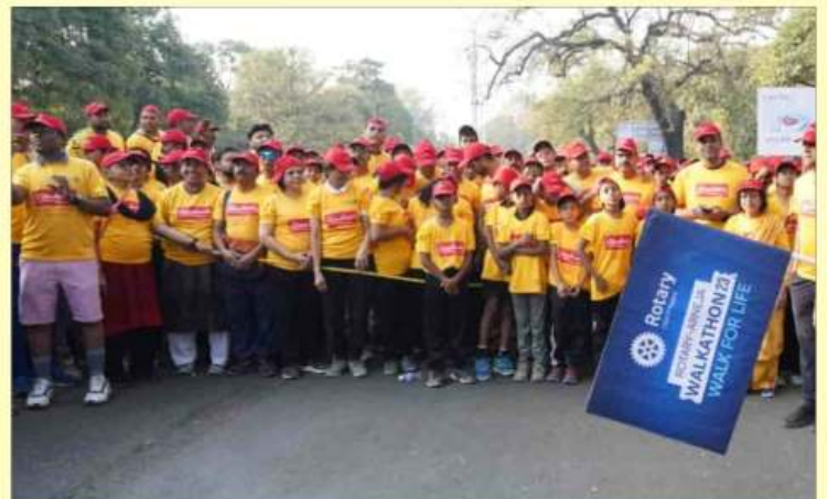
The Rotary Arneja Walkathon 2023 promoted community togetherness and a healthier society. The Walkathon exceeded expectations in participation and engagement